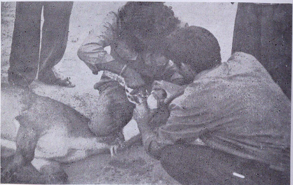
(B) Providing water through water bottle to injured rojh.