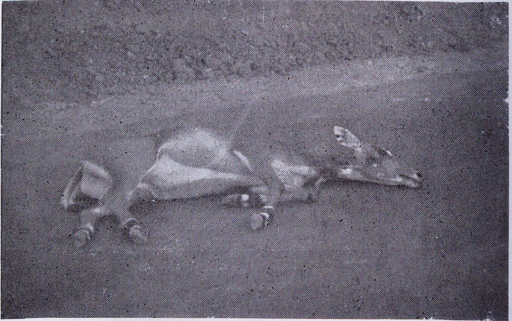
(A) Female rojh lying on road after hit by some vehicle near Manaklao.