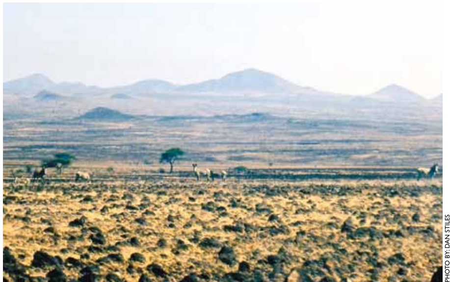
Grevy's zebra are still found in small numbers around the Huri Hills.

H eat rises off the cracked, salt-encrusted plains. Small, dispersed herds of dust-devils wander leisurely away in the distance over the barren flats. In the middle of the Chalbi desert, standing on the bonnet of my Land Rover, I can see only a dual line of tyre tracks leading to the horizon in front and in back of me. There is not a cloud in the pale blue sky and a tremendous wind blows incessantly out of the south east, heading for Lake Turkana, about a hundred kilometres away.