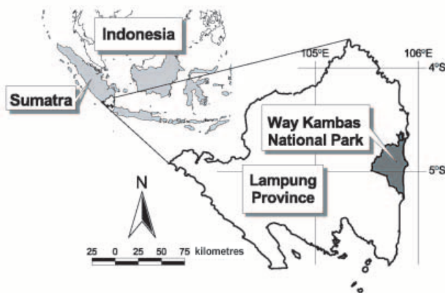
Figure 1 Map of Way Kambas National Park in Lampung, Sumatra, Indonesia.

Way Kambas National Park is located in Lampung Province in south-eastern Sumatra (Fig. 1). The 1300 km 2 Park has been identified as an important location for conservation because it is one of Sumatra's last lowland rainforests, contains significant populations of tigers, elephants and other endangered species, and is one of only six national parks in