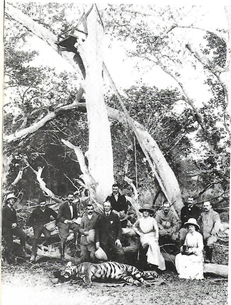
LEFT: The Hyderabad tiger hunt at which the old shikar was killed, April 1902 (see Lady Curzon's Hyderabad Journal).