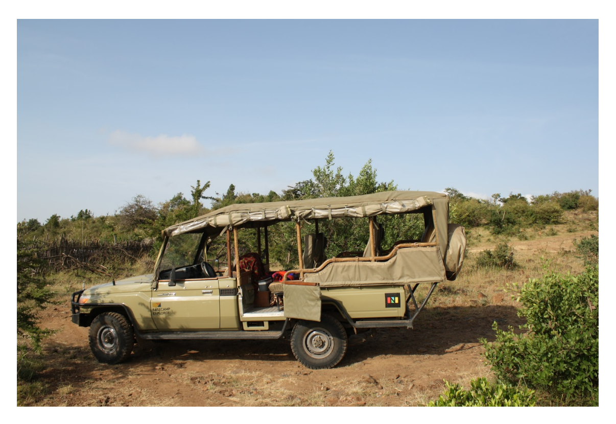
Sustainable tourism in Naboisho Conservancy, Kenya