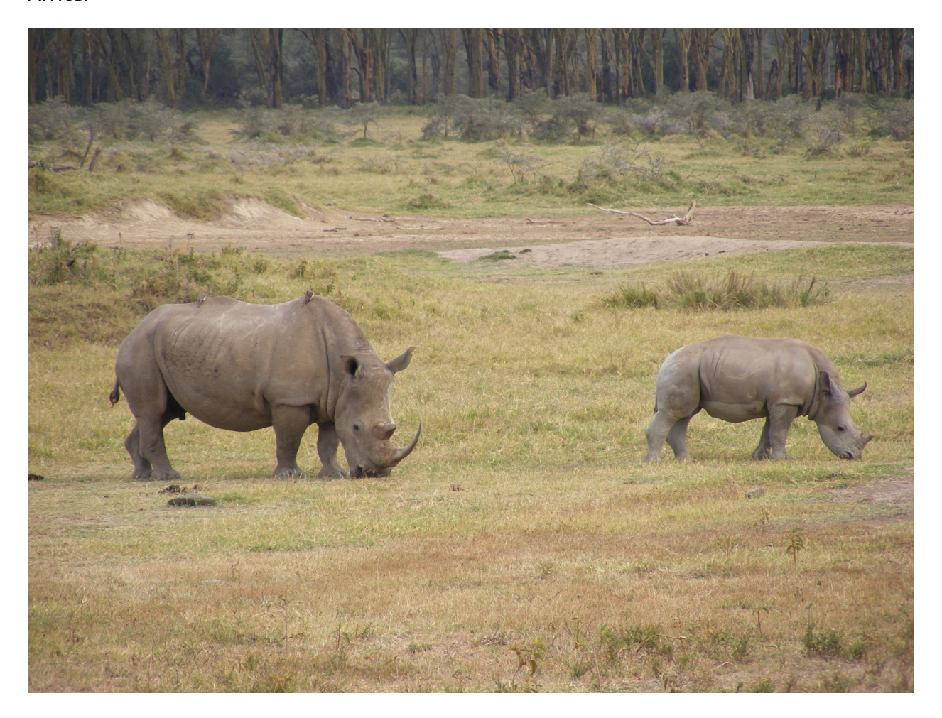
Wild rhinoceroses in Kenya

Conservation Initiative on Human Rights, an NGO consortium that seeks "to improve the practice of conservation by promoting integration of human rights in conservation policy and practice." Instead of increasing the supply of weapons to an already deadly conflict (which too often leak to organized crime networks or are misused by state actors), States, international organizations and NGOs should seek to slow this supply and empower local social structures that already work for peace, rule of law and sustainability. For example, a 2013 IFAW report, Criminal Nature , recommended addressing wildlife crime through the strengthening of "policies and legal frameworks ... at the local, national, and international levels." The ATT could be play a useful role in the development of such a framework in East Africa.