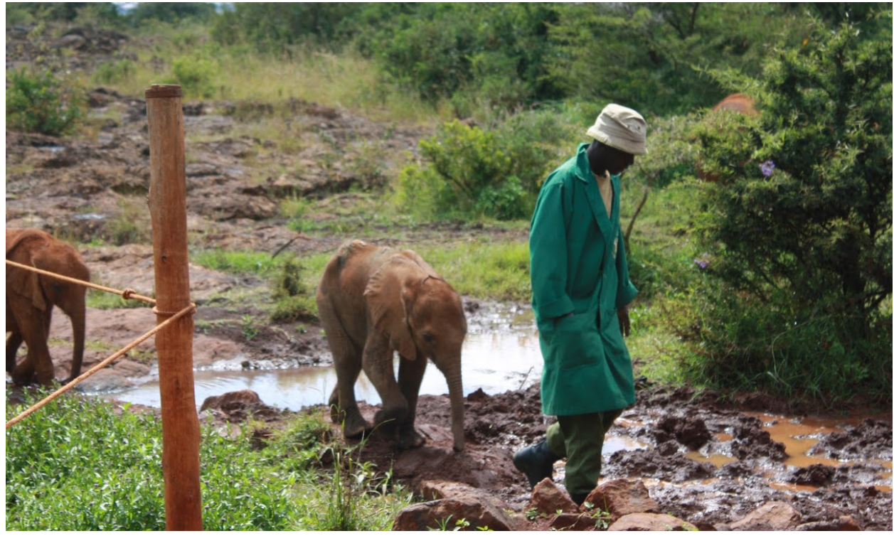
Orphaned elephants receive care at the David Sheldrick Wildlife Trust in Kenya.

The following section explores the potential usefulness of the ATT for East African States and civil society organizations seeking to address and mitigate the human and wildlife impact of armed violence in the region, focusing on wildlife poaching. This is by no means the only form of organized violence in the region, nor is its coverage here exhaustive. Rather, I aim to offer a possible application of the ATT that others in the region can critique and build upon.