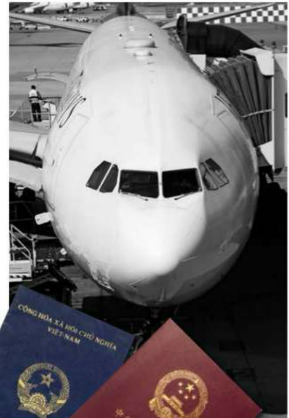
ARRESTS OF RHINO HORN SMUGGLERS POINT TO RESURGENT CHINESE AND VIETNAMESE INTEREST IN A CRUEL ILLEGAL BUSINESS THAT HAS PROVED HIGHLY LUCRATIVE FOR SOUTH-EAST ASIAN CRIMINALS.