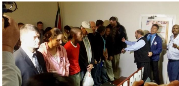
The Accused in Court