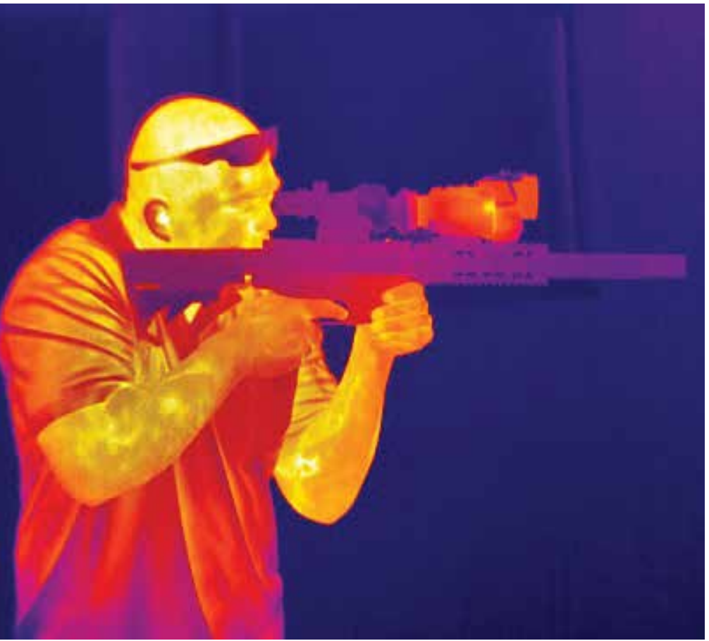
Thermal cameras can show images of intruders at night.

medium and small sized mammals such as Buffon kob and baboon were not. However animals did not react when the UAS passed over them indicating an absence of animal disturbance as has been the case with low flying aircraft and helicopters.