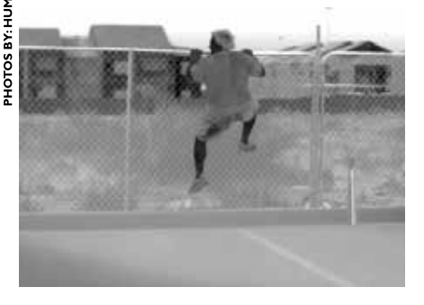
Top Left and below: Spotting intruders climbing a fence enables accurate deployment of security staff. Top Right: The MAJA drone airframe and its large storage area for onboard equipment.