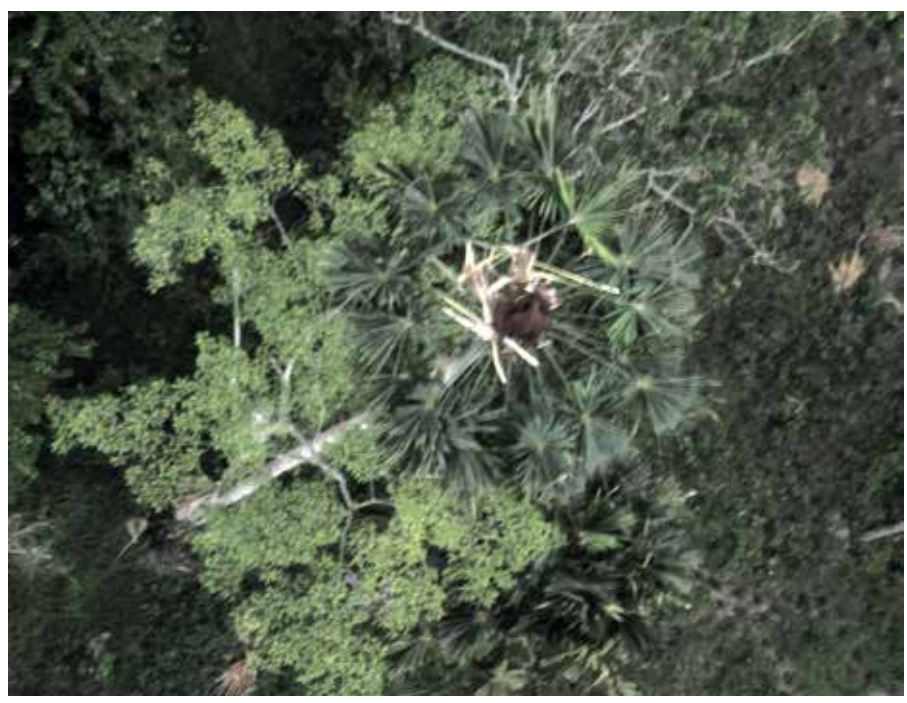
Orang-utan on its nest.