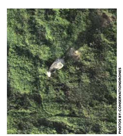
Elephant walking in dense forest.

Experts estimate orangutans could be extinct in the wild in less than 25 years. Their effective conservation requires accurate and timely data on their distribution, density and land cover change traditionally obtained by ground surveys which are too expensive and time consuming to conduct on a