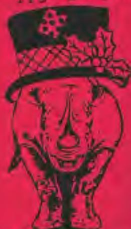
The best is yet to be in 93!