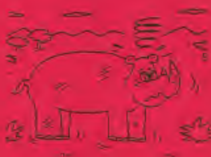
What Gooey Rhinos do Rhinos do better The rhinos.