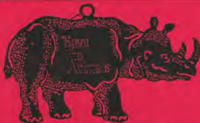
Ornament available from WWF. Call 1-800-634-4444 to order.

NEED LAST MINUTE GIFTS? Don't forget your local zool! I just found some inexpensive (less than $10) rhino gifts at the Phoenix Zoo. Book outlets and used book stores can be goldmines for books about or including rhinos. Check out teacher supply stores. I found great rhino stickers for $2. P.S. I still have a few Mission Rhino books ($5) and some duplicates for sale if you are desperate. Call me to order.