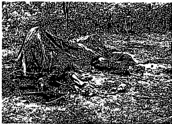
Remains of an elephant rotting after removal of the tusks by commercialised poachers in Ivory Coast.

Ivory may be a primary or secondary product . In the first case elephants are killed for the express purpose of taking their tusks for monetary gain. The rest of the animal is either left to rot or the meat is eaten by local people. In the second instance elephants are killed for other reasons such as the prevention of damage to agriculture or silviculture, protection of humans and their houses, regulation of the numbers of elephants in protected areas such as national parks, and also in the form of recreational and trophy hunting. The utilisation of their tusks together with meat and hides then becomes a secondary aspect and is unrelated to the motive of killing the elephant. Historically, the first situation was dominant, particularly in Africa where commercial hunting for ivory developed in the course of European colonisation. This type of indiscriminate "production" of ivory reduced elephant populations significantly in South and West Africa early on during the 19th century (3, 11). After the Second World War, with the rapid development of agriculture in Africa, the official control of elephants for the above-mentioned reasons became more and more important and furnished significant amounts of ivory for commercialisation. However, the illegal killing of elephants purely for their ivory has continued all over Africa and to a lesser extent also in Asia (12) to the present day.