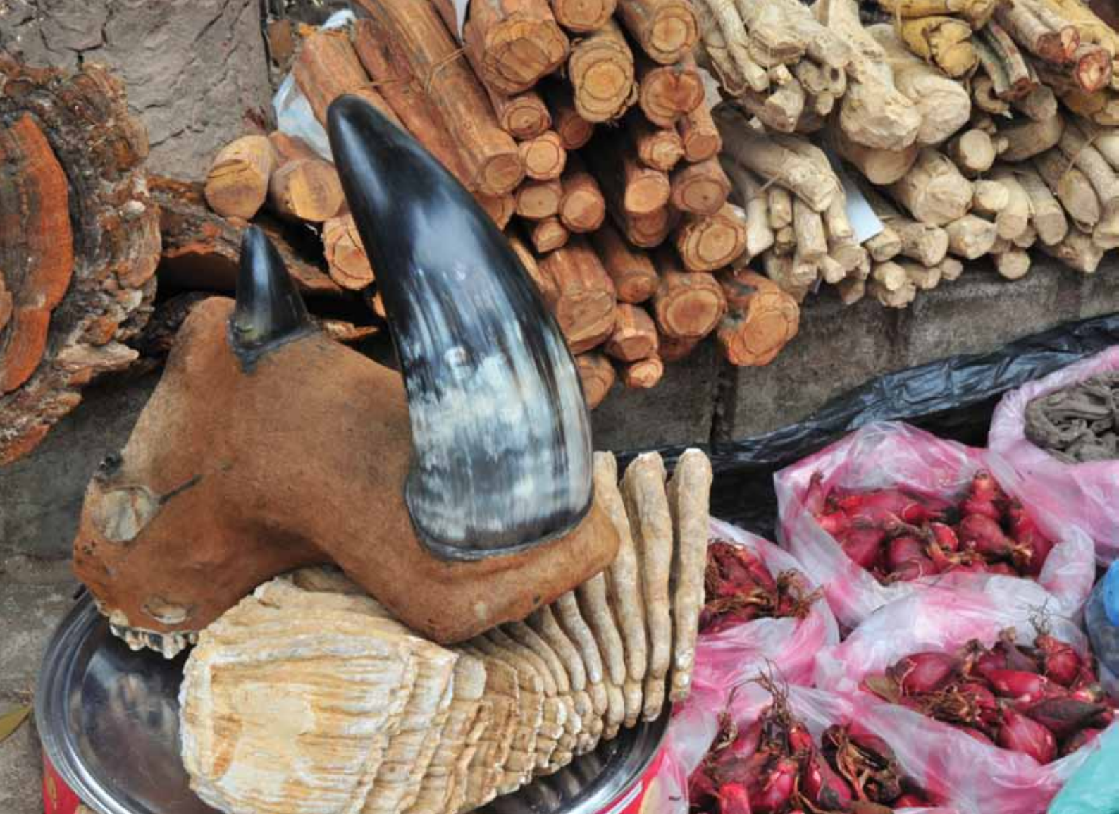
TOP: Some of the very bad fakes. However the elephant tooth underneath is real.