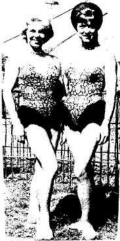
Clyde Beatty 1965