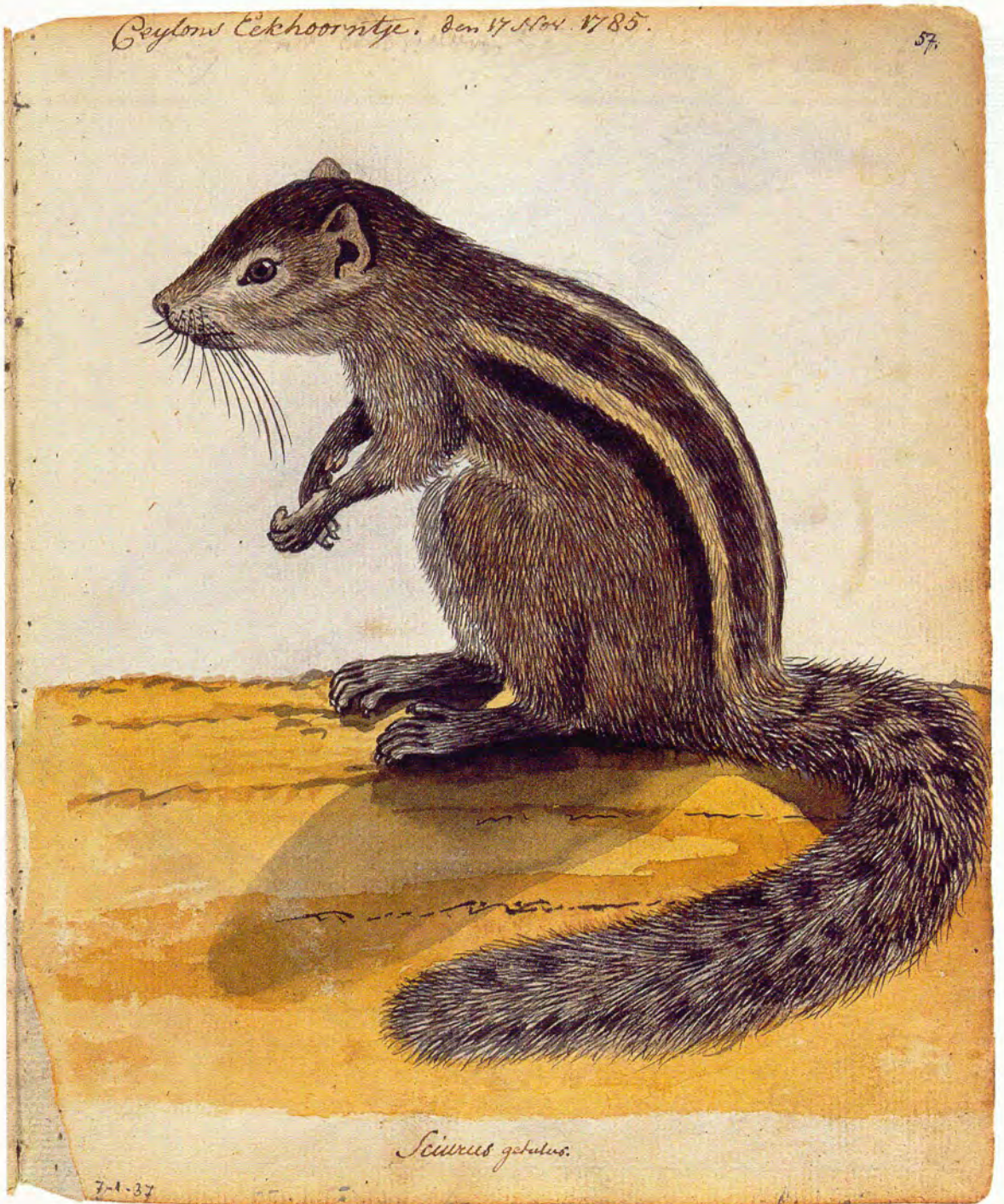
'Ceylons Eekhoornetje. den 17 Nov 1785.' 'Sciurus getulus.'