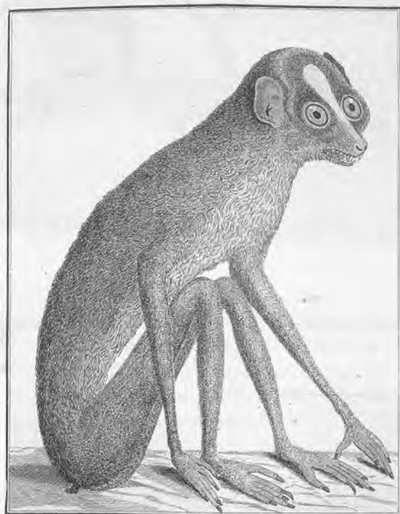
LEMUR TARDIGRADUS CEYLONICUS

Engraving of a slender loris, from an article by S.I. Ljung, after a drawing by Brandes. Royal Library of Sweden, Stockholm.