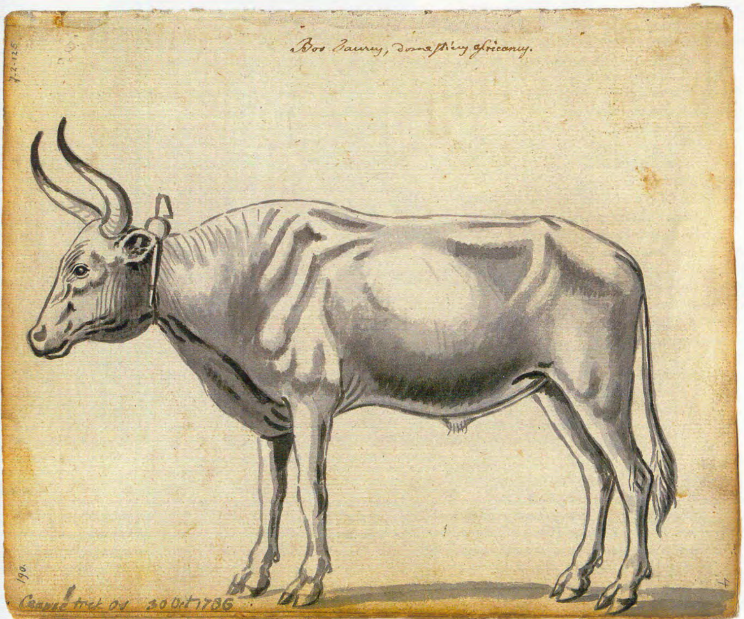
' Bos taurus, domesticus africanus. 'Cape trek ox 30 oct 1786.'

2. Ljung, 'Anmärkningar öfver Lemur tardigradus', 59.