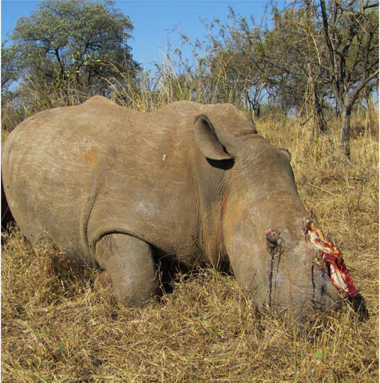
IZZY, MAURICEDALE GAME RANCH, AUGUST 11, 2011