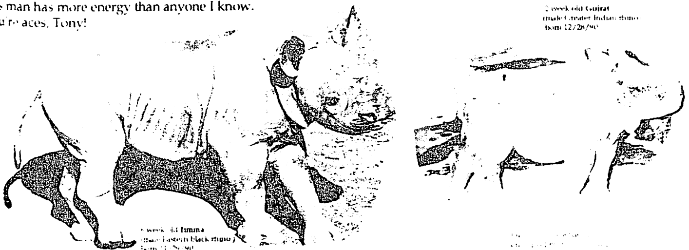
2 week old Sumatra rhino (Eastern black rhino) born 11/26/90