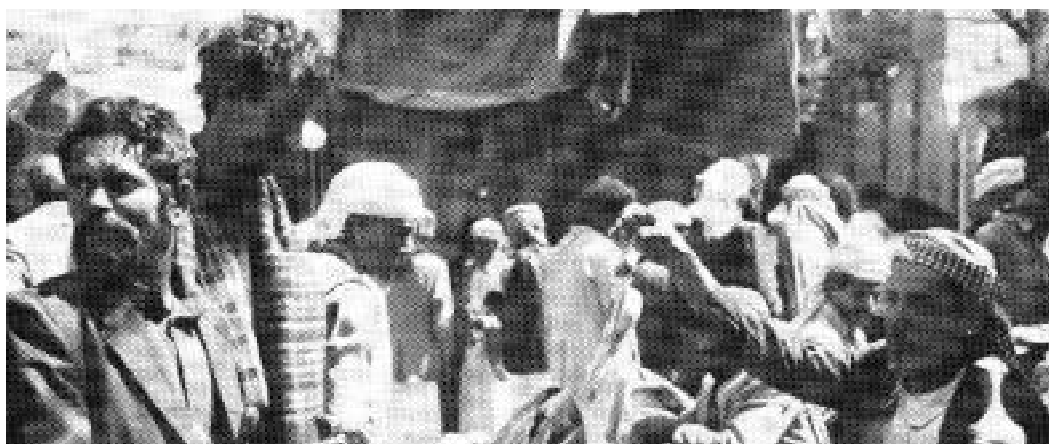
A retailer displays his shining daggers to potential buyers in Sanaa souk

We left Yemen with high hopes that if these final efforts are implemented by the government and the Grand Mufti, the trade in rhino horn in the country would almost be wiped out, but not at the expense of the dagger industry, a unique element in the cultural heritage of Yemen and one which is very likely to live on in that country of many ancient traditions.