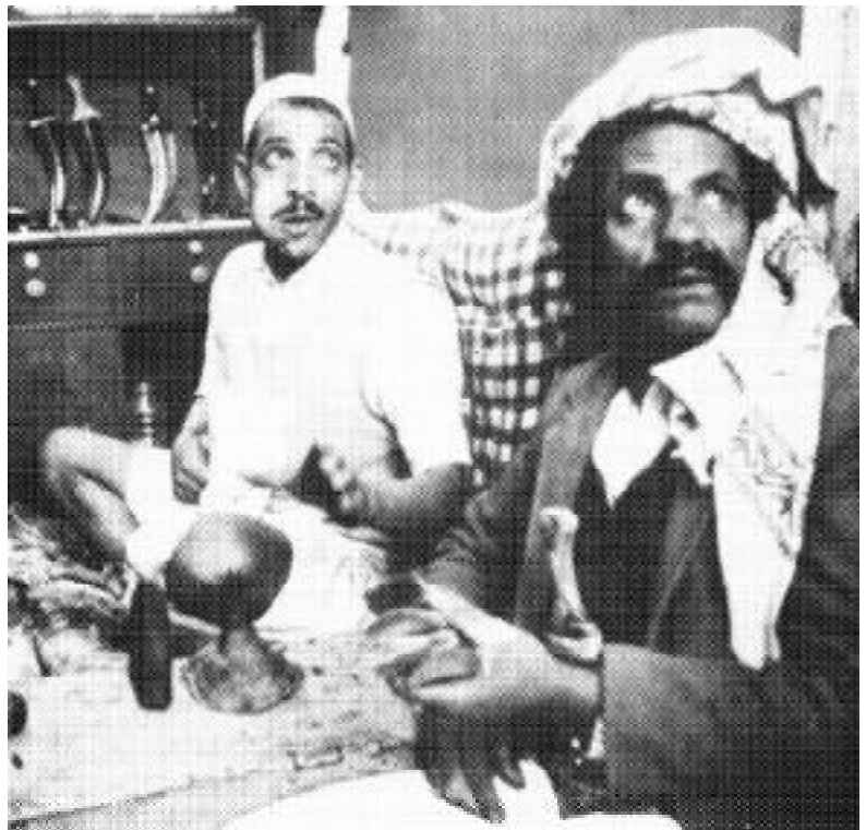
In 1990, a craftsman in Sanaa souk displayed two full black rhino horns for us to see and reluctantly let us photograph them