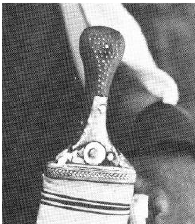
The granular-look, as shown in this dagger hilt, is very popular and reveals the origin to be rhino horn

Perhaps the most effective way of curtailing demand for rhino horn is with the help of Yemen's highly respected Grand Mufti, the spiritual leader of this very religious country. In what was very nearly our last hour in Sanaa, the American ambassador brought us to meet this venerable figure in his traditional house in the old town. He was extremely willing to help us and agreed to issue a fatwa , or religious edict, which could be published in the newspapers, stipulating that it is against God's will to cause the extinction of an animal