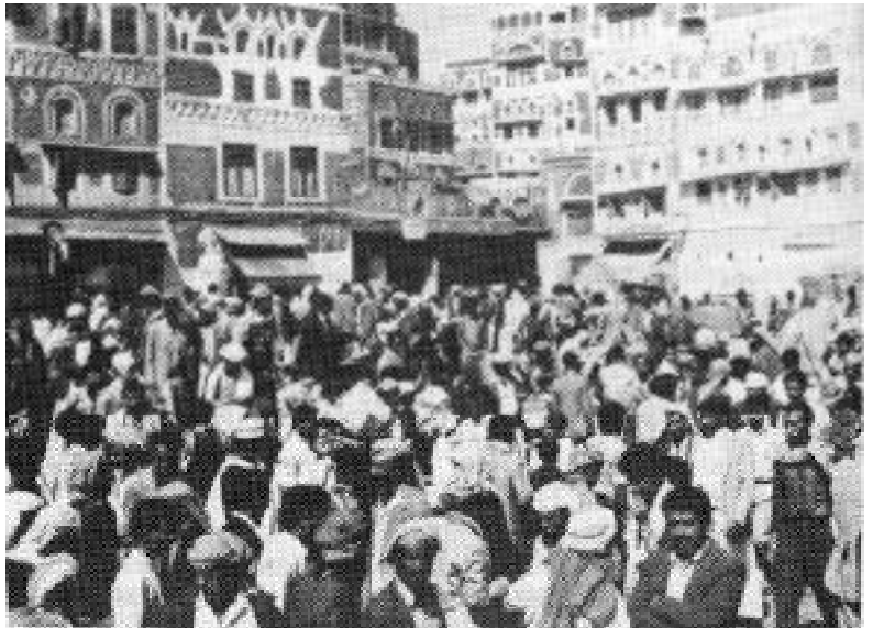
The Sanaa souk where most of Yemen's jambiyahs are made, is situated in the old town, unique with its traditional architecture