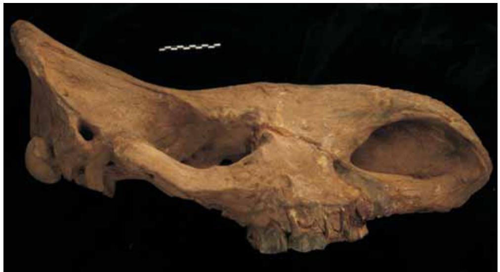
Fig 1 Lateral view of the skull of the woolly rhinoceros, Coelodonta antiquitatis , from the collection of the Museum of Palaeontology and Geology, Athens, Greece, wrongly ascribed to the Pleistocene fauna of Megalopolis, Greece.

the fossil elephants of Megalopolis and he published a series of articles (e.g. Melentis, 1961, 1963, 1966) on all the fossils from Megalopolis, including the skull of the woolly rhinoceros (Fig. 1) and the molar of the mammoth. The fossils from Megalopolis were excavated by Skoufos in 1902 (Fig. 2) and they remained in boxes till the sixties, when Melentis started to work on them. At that point the material from Megalopolis got mixed with some fossils from Ukraine. This happened because these fossils have the same brownish-black colour (Fig. 3) and obviously at that time there was no good record of the fossils stored in the collections. In his papers, he described several Middle Pleistocene species (which is the actual age of the locality), some Late Pleistocene species (the material from Ukraine and some incorrect determinations) and one Early Pleistocene elephant as well (the product of incorrect determination). It seems that Melentis never suspected any mistake. Neglecting the field notes written by Skoufos which clearly stressed