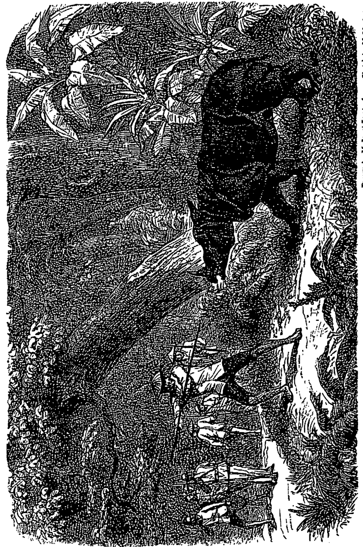
Drawn by M. Janet Langa, from a sketch by M. Mouhot.

The Ménom-Moune at Pimai is 75 metres wide in the dry season; in the rainy season it is from 6 to 7 metres