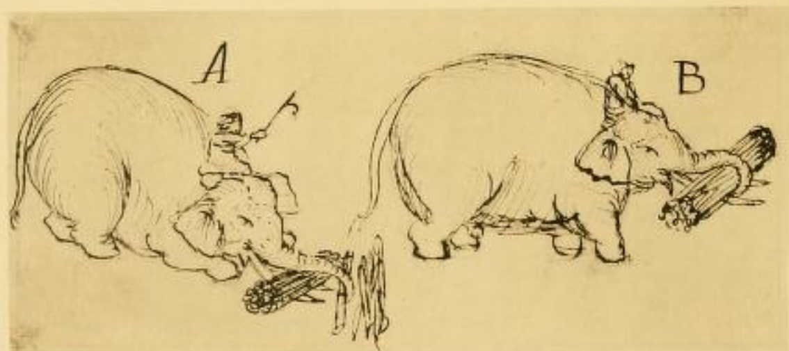
No. 38. What use Elephants are put unto.