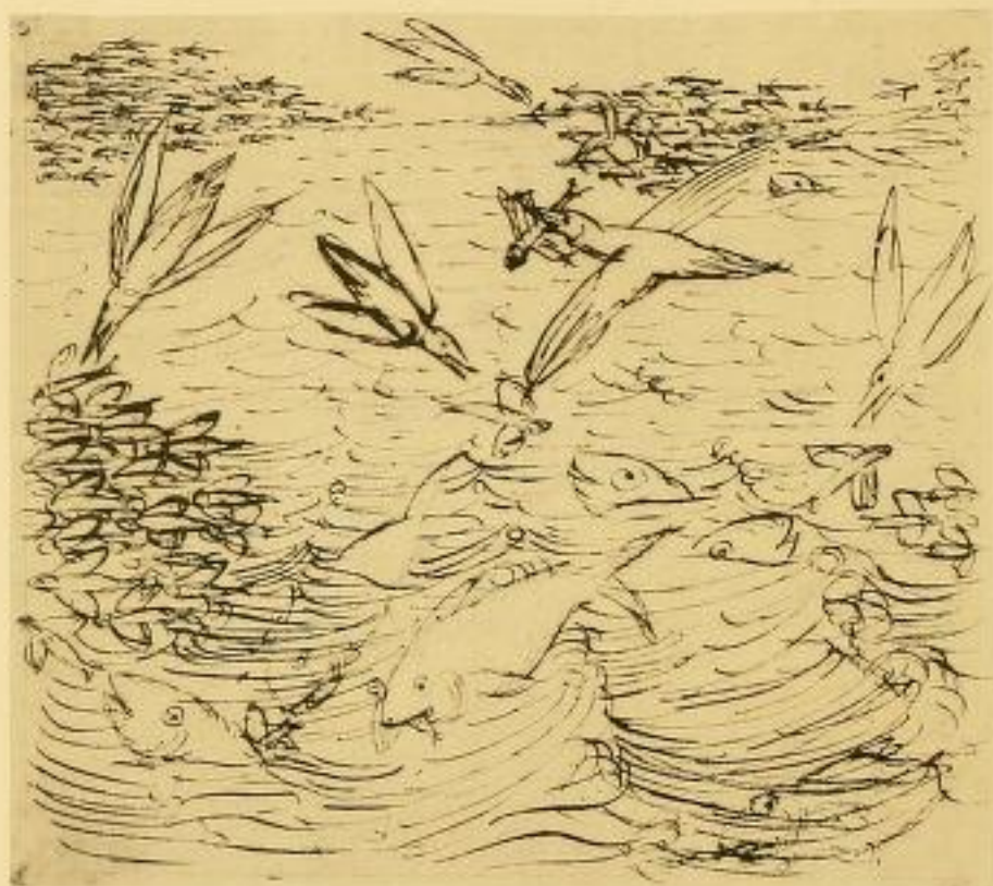
No. 40. Flying Fishes Chaced by Bonitos, etts.