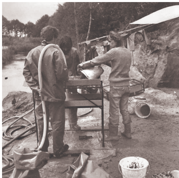
Fig. 3: In the 1970s nearly 200 m 3 of clay from the pit Russel-Tiglia-Egypte was sieved in search of micromammals.

clay bed, which was about two metres high. On average, 24 micromammal fossils per m 3 were collected, which suggests that the clay was poor in fossils. However, from the quadrant system used by FREUDENTHAL, it can be calculated that the majority of the molars come from the lowermost part of the section, where the concentrations are well over one hundred molars per m 3 . In contrast, some of the uppermost quadrants proved to be sterile.