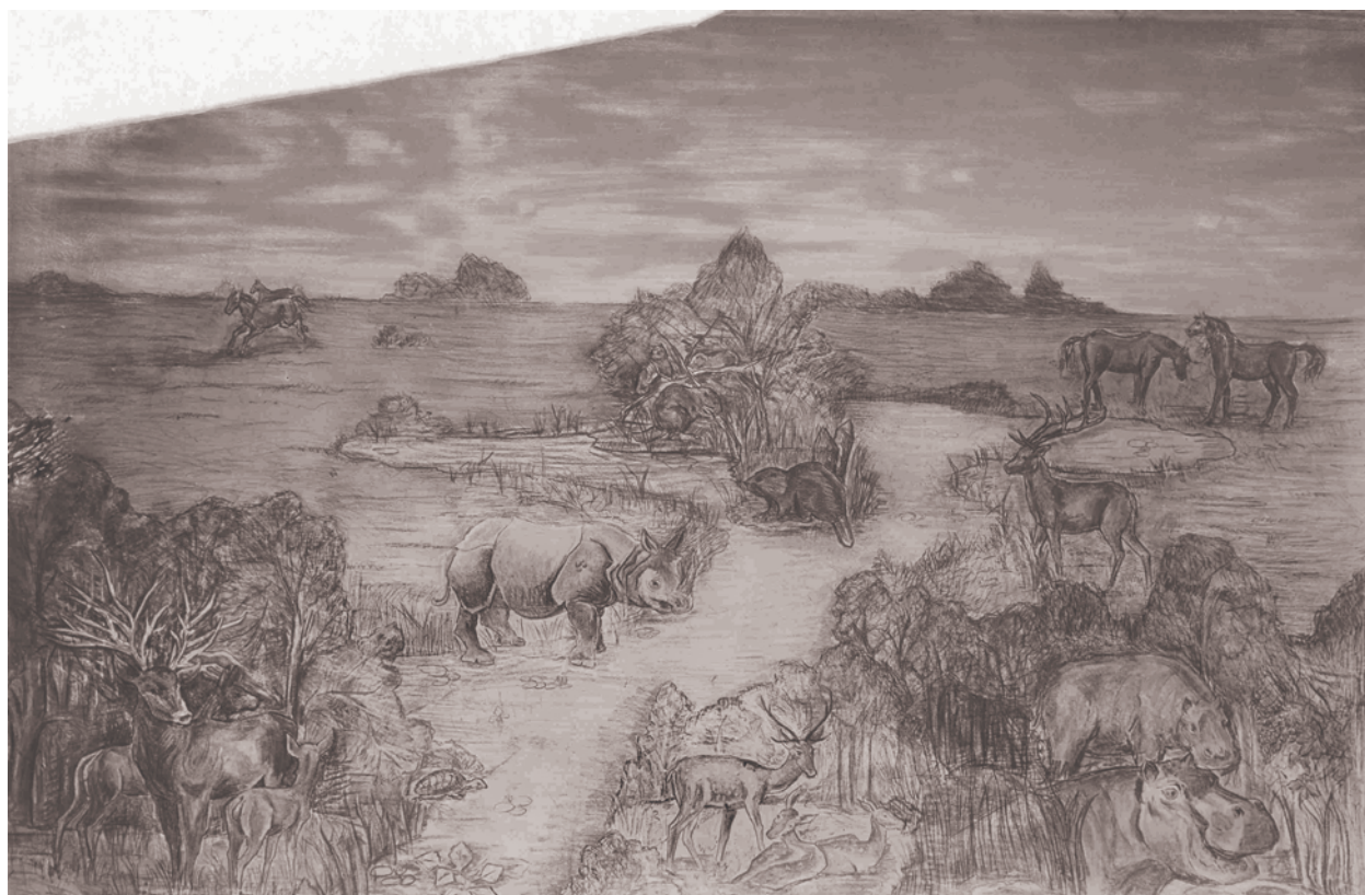
Fig. 4: The first reconstruction of the Tegelen landscape as made by Dubois. Note the presence of a hippopotamus, based on the false identification of Sus strozzii .

Non-mammalian vertebrates: Most of the papers on the Tegelen fauna deal with the mammals, but these are not the only vertebrates found in the Limburg locality. GAUDANT (1979) distinguished eleven species of fish in the Tegelen fauna. The assemblage consisted of species still found in The Netherlands and was indicative for slow moving to stagnant waters. The only reptile to be described from Tegelen thus far is the European pond turtle, Emys orbicularis , already noted by DUBOIS (1904). SCHREUDER (1946) gave a description of a beautifully preserved carapace of this turtle. Preliminary identifications made by MASSIMO DELFINO of Florence University show that Tegelen had a rich herpetofauna, with at least thirteen different species.