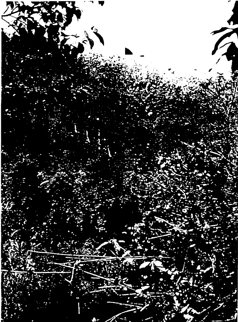
TYPICAL GAME COUNTRY, LAISHENG.