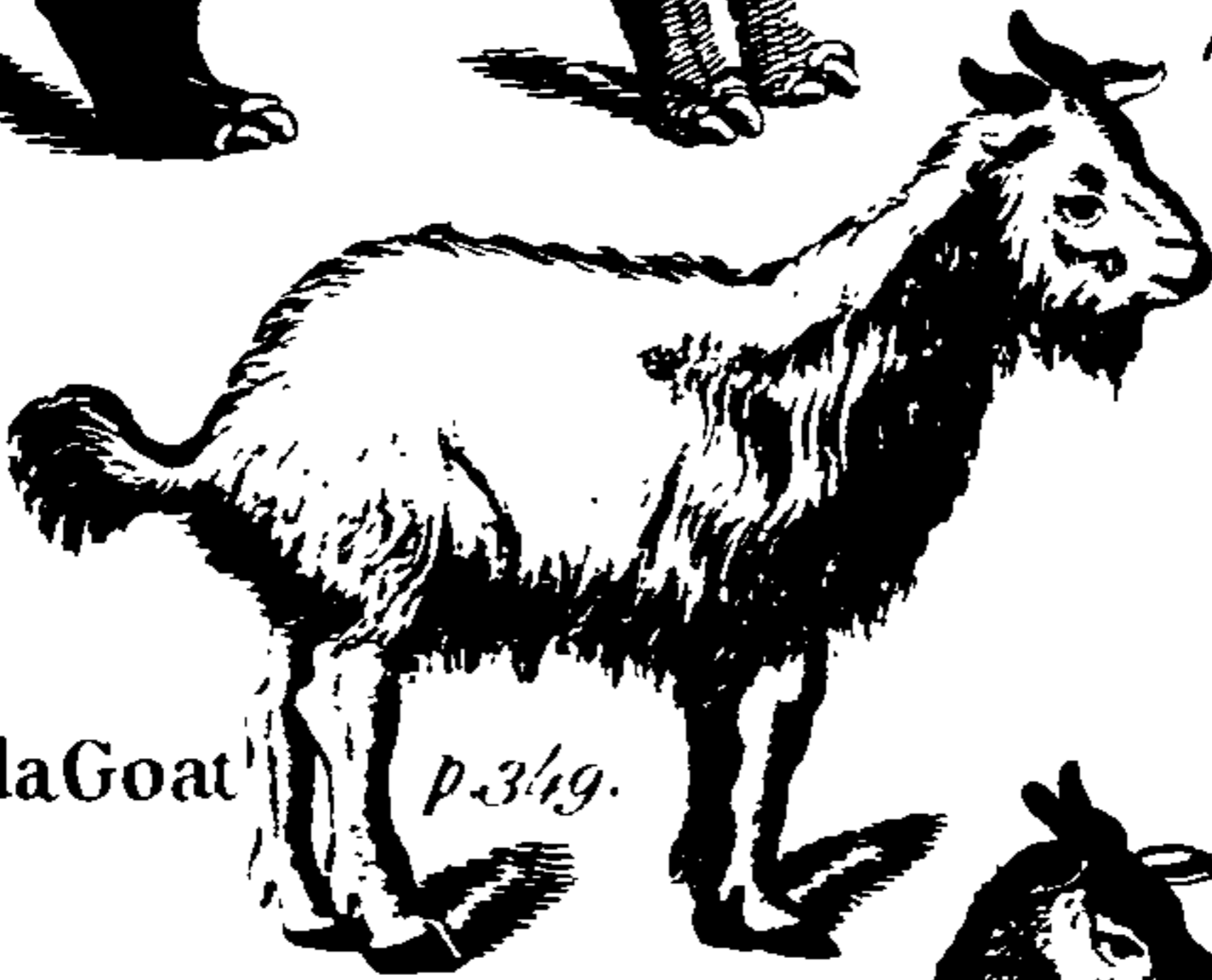
The Juda Goat