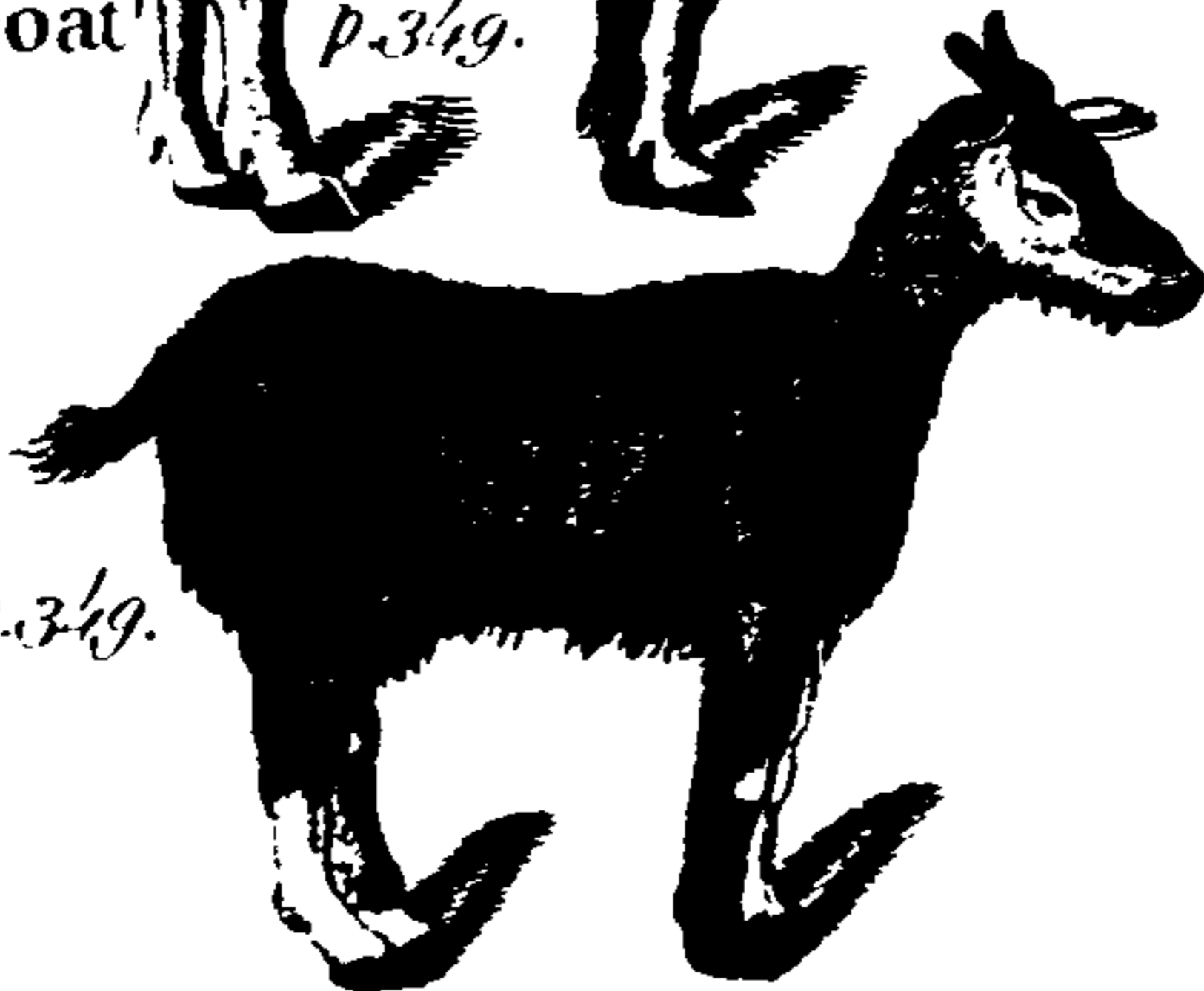
Ditto p. 319.