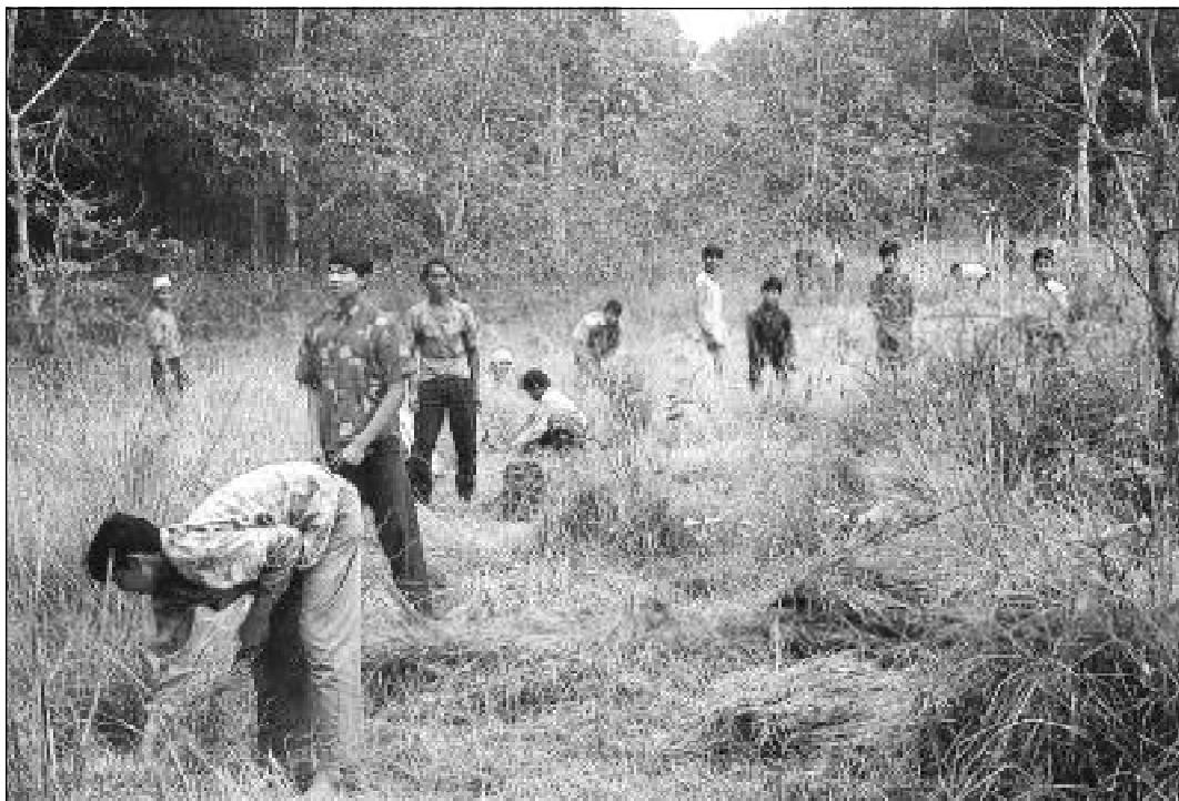
The policy of allowing villagers into Bardia National Park to collect thatch and reeds for houses has been very popular. In the mid 1990s the grass-cutting season was shortened from 15 to 10 days to reduce disturbance to wildlife.