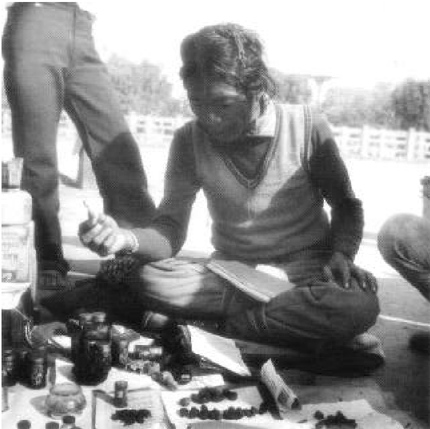
Many parts of the rhino are for sale in Nepal as medicine, including the umbilical cord here offered for sale in Kathmandu.

with their needs for water, firewood, grazing, fodder, medicinal plants, fish and meat. This problem has occurred in community projects already being implemented in Africa. The user groups around Chitwan and Bardia must find a way of limiting new people entering the area to prevent the natural resources within the buffer zones and Parks from being over exploited.