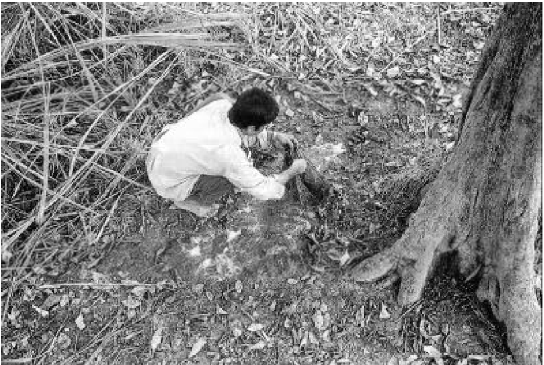
When an elephant driver sees a rhino urinating in Chitwan National Park, he will often collect the urine. People living around Chitwan believe it reduces chest congestion and asthma.