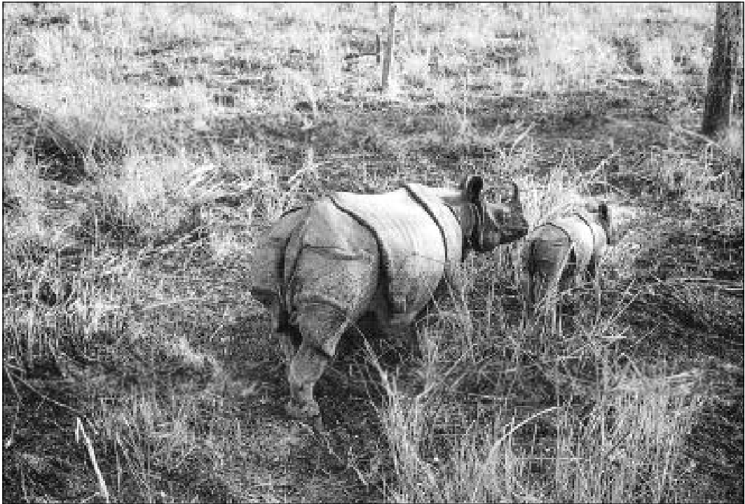
In Chitwan and Bardia Parks, villagers lightly burn some areas to help them collect the reeds. It also makes it easier for tourists to see rhinos.

Besides this UNDP-initiated project, local NGOs are involved in community development schemes around Chitwan Park. One of the most successful is an eco-tourism project which was set up in the previously degraded Baghmara Forest on the northern border of Chitwan Park and a few kilometres from the main tourist area, Sauraha. The KMTNC and USAID were the principal implementers of the project. In 1989, the KMTNC organised the planting of fast-growing trees on 32 hectares of severely overgrazed land within the 400-hectare area of Baghmara Forest. By the end of the first year a user group was formed to manage this plantation. Over the years more of the land was replanted with trees, and grass areas were developed. Villagers constructed fences and trenches around Baghmara with help from the Trust and the Park authorities. In June 1995, the District Forest Office formally handed over the whole of Baghmara Forest to the local user group committee to manage for themselves as the Baghmara Community Forest. It was opened for tourism at the end