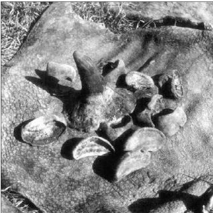
Asian rhino horn is generally ten times more valuable than African rhino horn. Nails, like the horn, are consumed in many parts of Asia to lower fever, while the skin is used for curing human skin diseases.

common and local sources of funds must be found for such projects to continue. Nepal, however, is not seeking large amounts of foreign funding, having the benefit of significant Park revenue to share with the villagers' projects. Yet the authorities must be aware that these projects must become self-financing as soon as possible or they will be an endless drain on Park revenue, which could otherwise be spent on improving Park management activities.