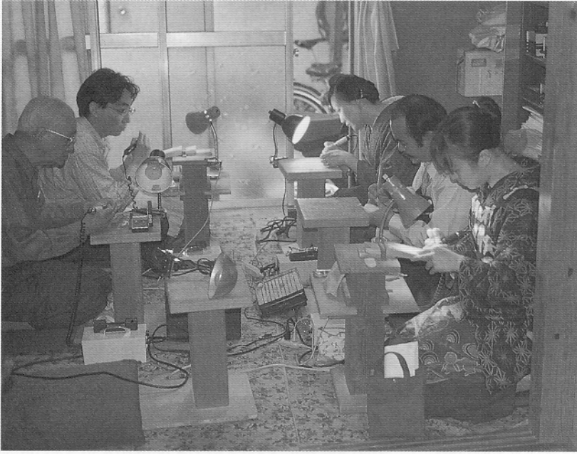
Ivory-carving association members in Japan sometimes group together to carve ivory at the end of the day to share information and sometimes help apprentices.

gal, but regulated by a variable set of controls. Vendors' views are interesting by their subjectivity, showing that most people who depend on their livelihood on ivory are pessimistic about the future, with stockpiles diminishing, and wildlife laws tightening.