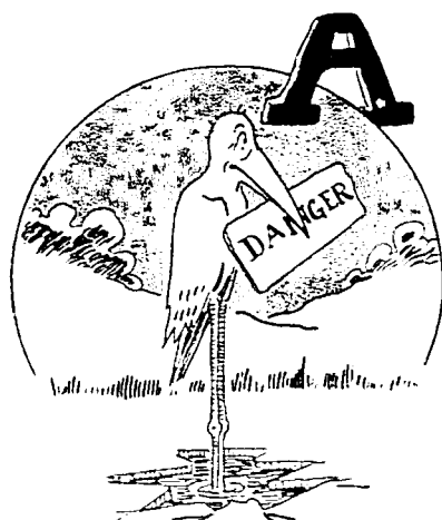
A chilly job at the Zoo.